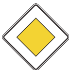
Road with priority

If you see these road signs, other drivers have to give you priority.